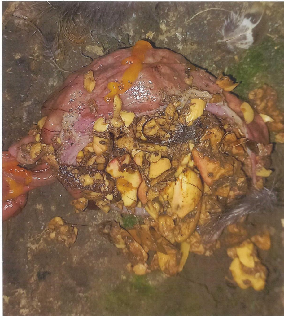
Pheasant crop, showing acorns. Shot 31 May 25 at Waimea River Park.