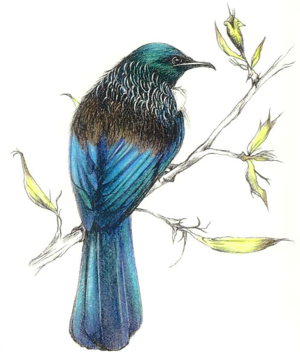
Tui Ink and Coloured Pencil on Paper by Meryth Dobbie © @craft.compass www.meryth.com