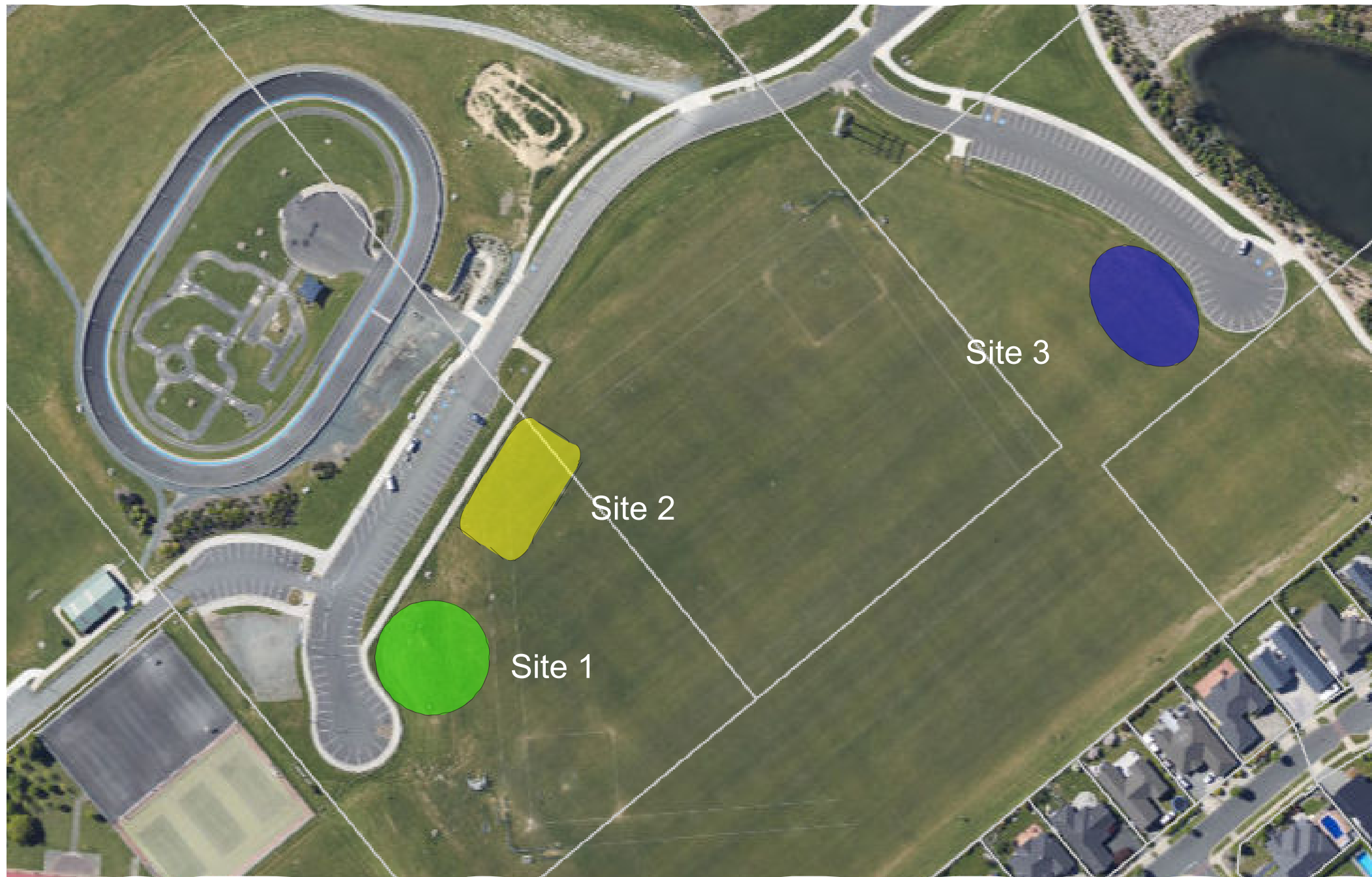
Site plan - not to scale