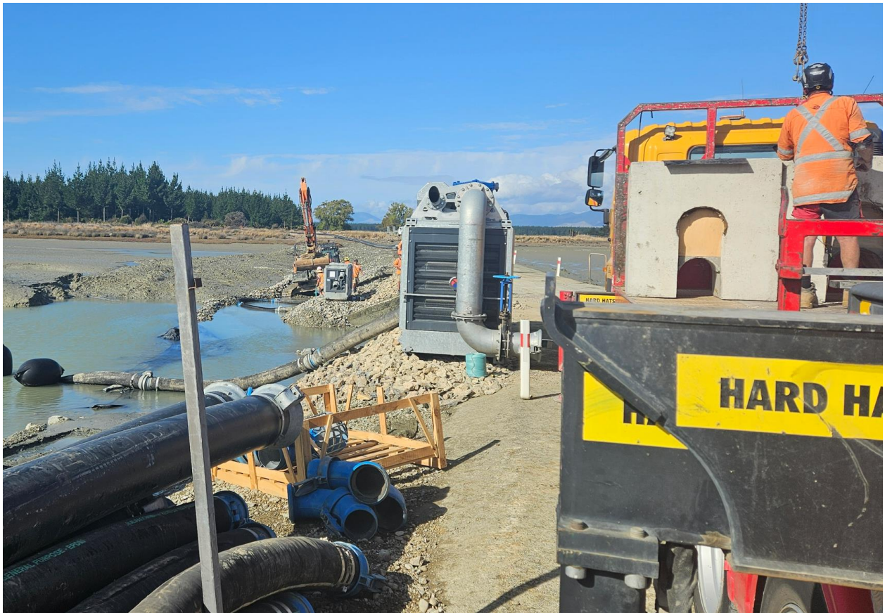
Figure 2: Pipework installation alongside Bell Island Causeway