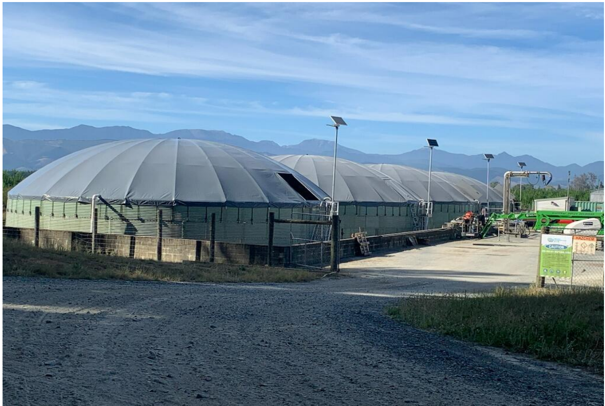
Figure 4: Motorua Rabbit Island Tank Covers

5.5.3 Site improvement works at Bell Island include: