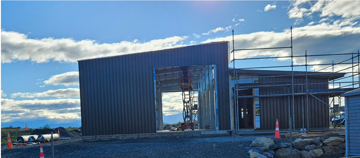
Figure 3: Facilities/Workshop Building Progress