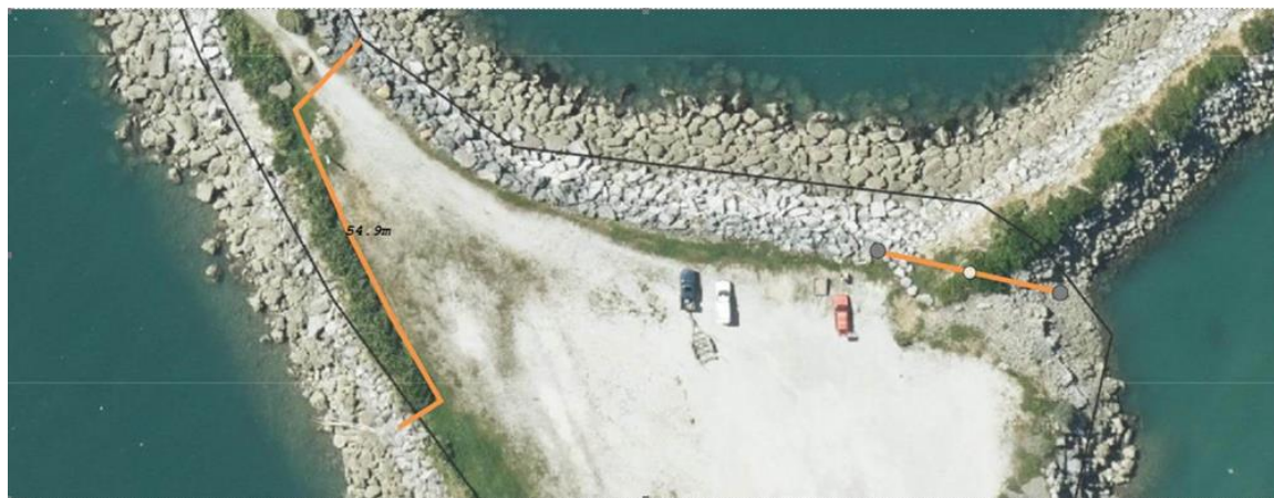
Figure 2: Recommended fencelines by the Hearing Panel, outlined by the orange lines.