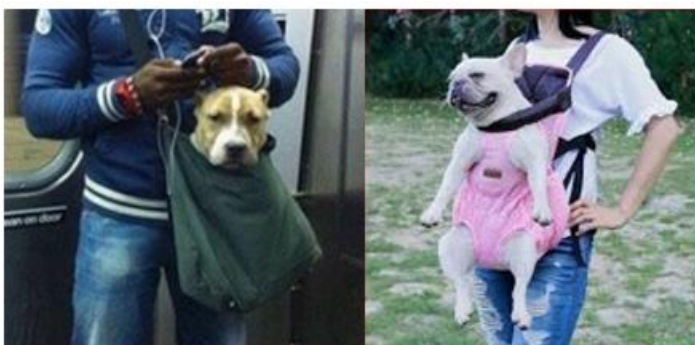
Unapproved domestic pet carriers