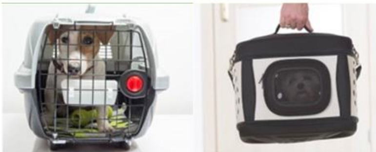
Suitable approved domestic pet carriers (must fit on passenger's lap or under seat)